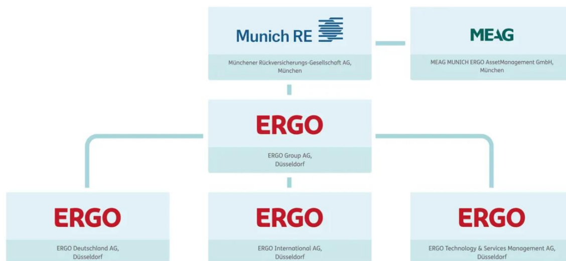
Figure 2. Structure of Munich Re and ERGO Group AG

The Company is 100% owned by ERGO International AG, Germany, which is part of the ERGO Group AG, Germany, which in turn is part of the Munich Re Group (Münchener Rückversicherungs-Gesellschaft AG, Munich), see Figure 1 below. ERGO Group is one of the major insurance groups in Germany and Europe, offering a comprehensive spectrum of insurance services.