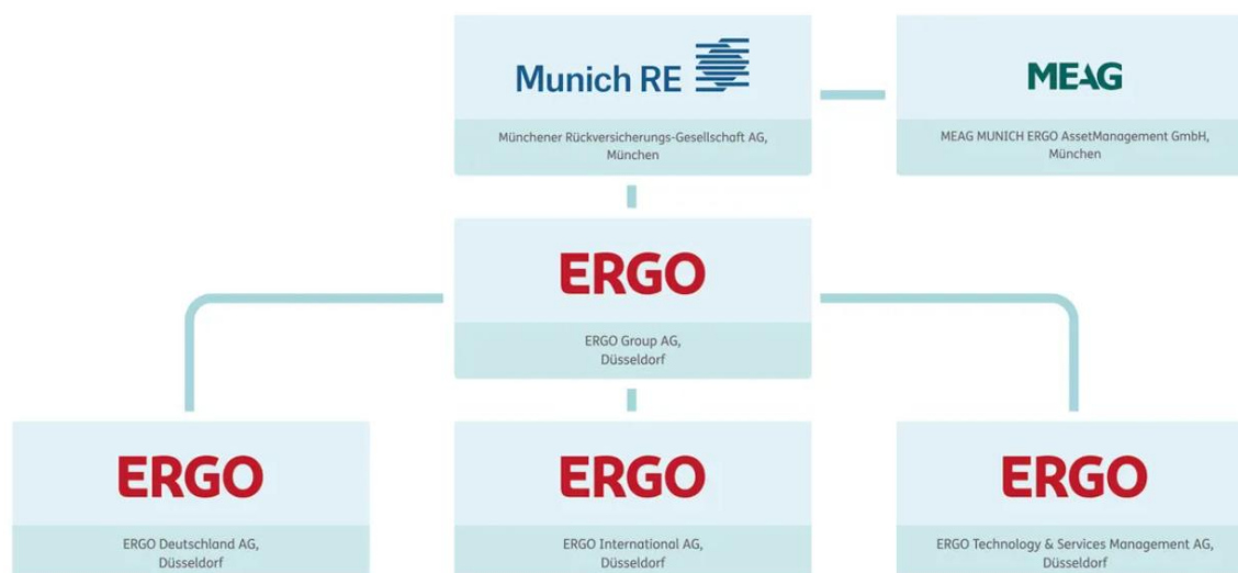
Figure 2 Structure of Munich Re and ERGO Group AG

The Company is 100% owned by ERGO International AG, Germany, which is part of the ERGO Group AG, Germany, which in turn is part of the Munich Re Group (Münchener Rückversicherungs-Gesellschaft AG, Munich). ERGO Group is one of the major insurance groups in Germany and Europe, offering a comprehensive spectrum of insurance services.