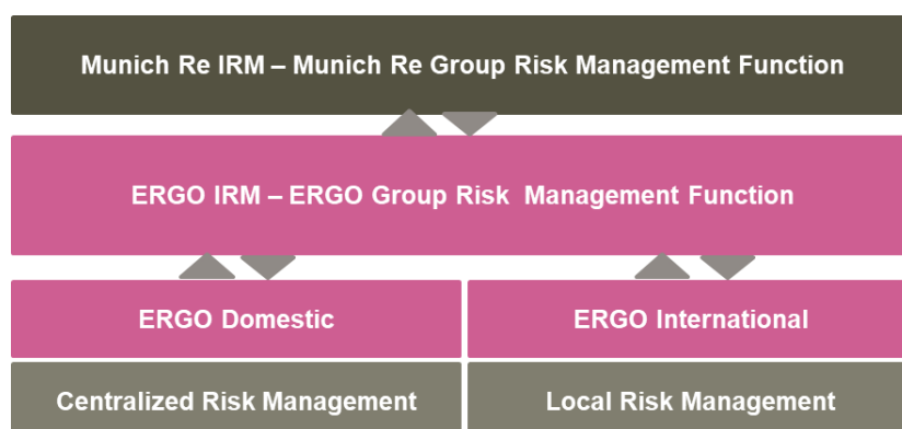
Figure 4: Risk Management Organization with in Munich Re and ERGO Group

Methods, standards, processes and policies are defined by ERGO IRM in line with the overall Munich Re Group framework. The local risk management function is responsible for implementing the IRM methodology on a legal entity level. The Management Board of the Company is ultimately responsible for risk management.