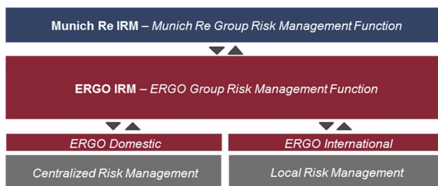
Figure 2: Risk Management Organization within Munich Re and ERGO Group

Methods, standards, processes and policies are defined by ERGO IRM in line with the overall Munich Re Group framework. Local risk management function is responsible for implementing the IRM methodology on a legal entity level. The Management Board of the Company is ultimately responsible for risk management.